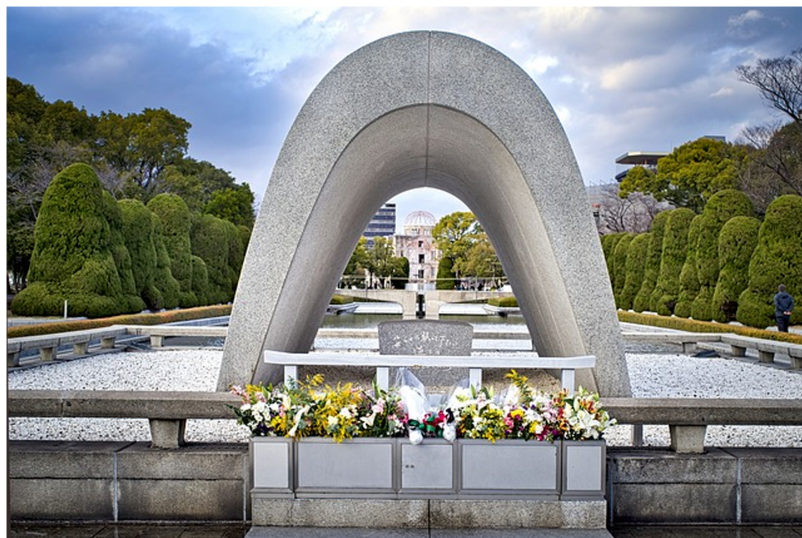
Fig. 1.5. Cenotaph for the Bomb Victims.

ceremony takes place at the Peace Memorial Park. Speeches are delivered, wreaths are laid at the Cenotaph, and a moment of silence is observed at 8:15 a. m., precisely marking the moment of detonation. This annual commemoration serves as a reminder of the profound impact of nuclear weapons and the imperative of pursuing peace.