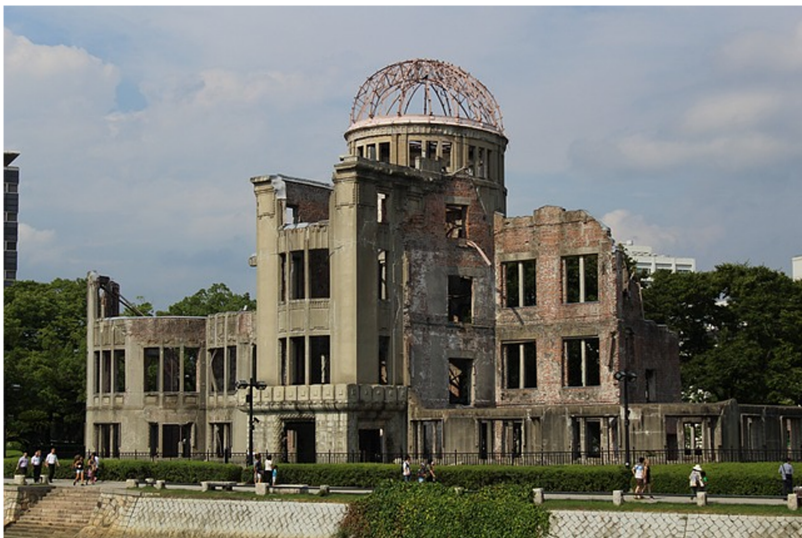
Fig. 1.4. Atomic Bomb Dome.

At Hiroshima Peace Memorial Park, at the heart of the park lies the Peace Memorial Museum, comprised of two buildings that provide a comprehensive overview of Hiroshima's history and the advent of the nuclear bomb. The Atomic Bomb Dome was originally the Prefectural Industrial Promotion Hall (see Fig. 1.4). Despite the destructive power of the atomic bomb, the building remained standing amidst the devastation. Today, it is recognized as a UNESCO World Heritage site. It serves as a tangible connection to Hiroshima's unique history. Another significant feature of the park is the Cenotaph for the A-Bomb victims (see Fig. 1.5). The arched tomb honors those who lost their lives due to the bombing attacks. Names of over 220,000 victims are inscribed in a stone chest beneath the arch. Every year, on the anniversary of the bomb, a solemn