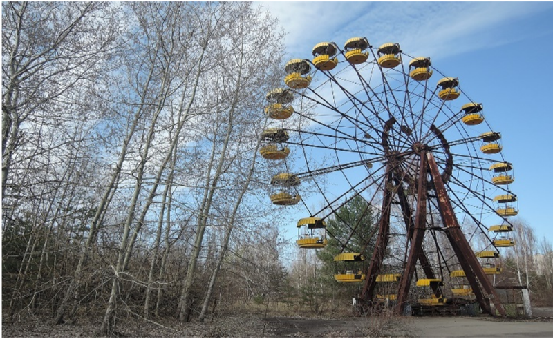
Fig. 1.2. Chernobyl Pripyat.

as a tourist attraction, as the site had a very successful year (2019), taking in over 124,000 visitors and bringing the economy of Ukraine over 100 million dollars via the tourism industry. According to the President, making Chernobyl an official dark tourism destination is one way to change its image as the site of the world's worst nuclear disaster. He hoped it would be possible to save and develop the city's tourism infrastructure and keep environmental conditions sound, as the area has been uninhabited for 35 years.