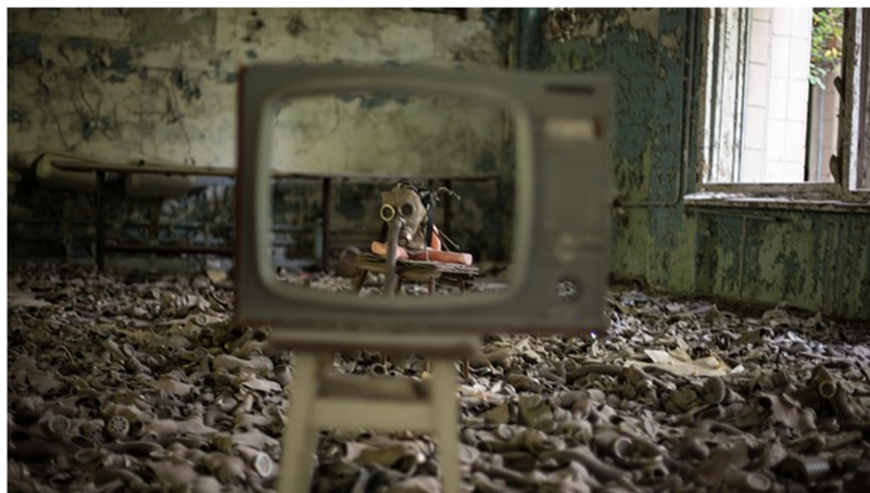
Fig. 1.1. Atom Nuclear Power Plant.

The Chernobyl disaster had a global impact. It highlighted the dangers of nuclear power and led to substantial changes in nuclear safety measures and regulations worldwide. The incident resulted in the decline of public confidence in the Soviet government and shaped public opinion and policies related to nuclear energy.